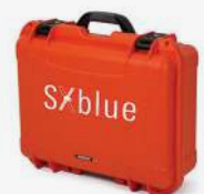
Hard Case (Optional)