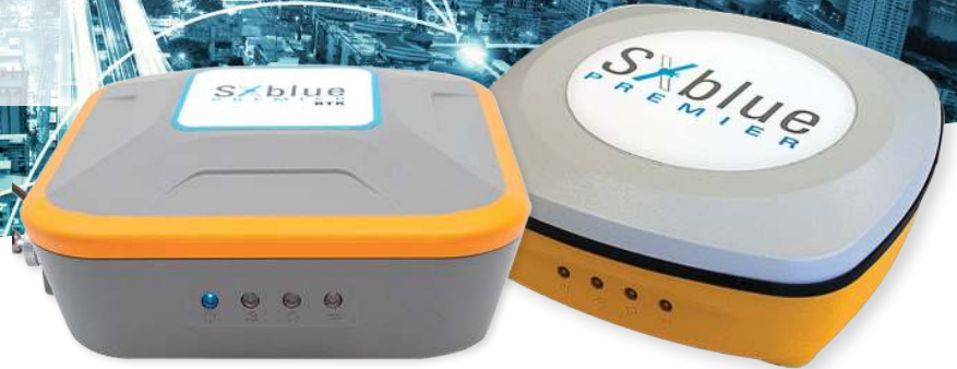
SX Premier RTK