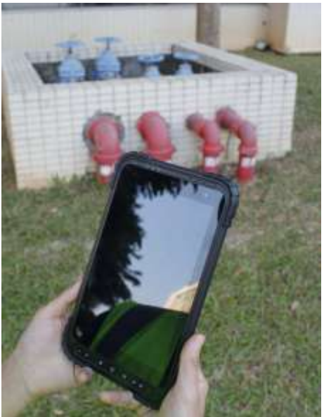
Fuel Gas Industry Collecting data on gas pipe networks. Inspections for gas pipe networks. Gas infrastructure positioning.