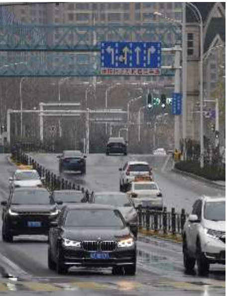
Transportation field Patrolling highways. Intelligent Transportation System. Transportation travel guidance.