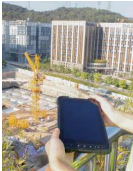
Construction Public architecture designing. Creating constructible models.