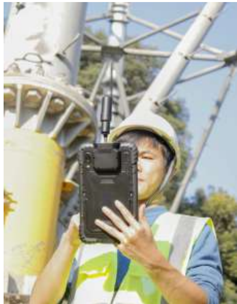
Electricity industry Collecting wireline infrastructure GIS data. Maintenance on electrical equipment. Designing electrical tower sites.